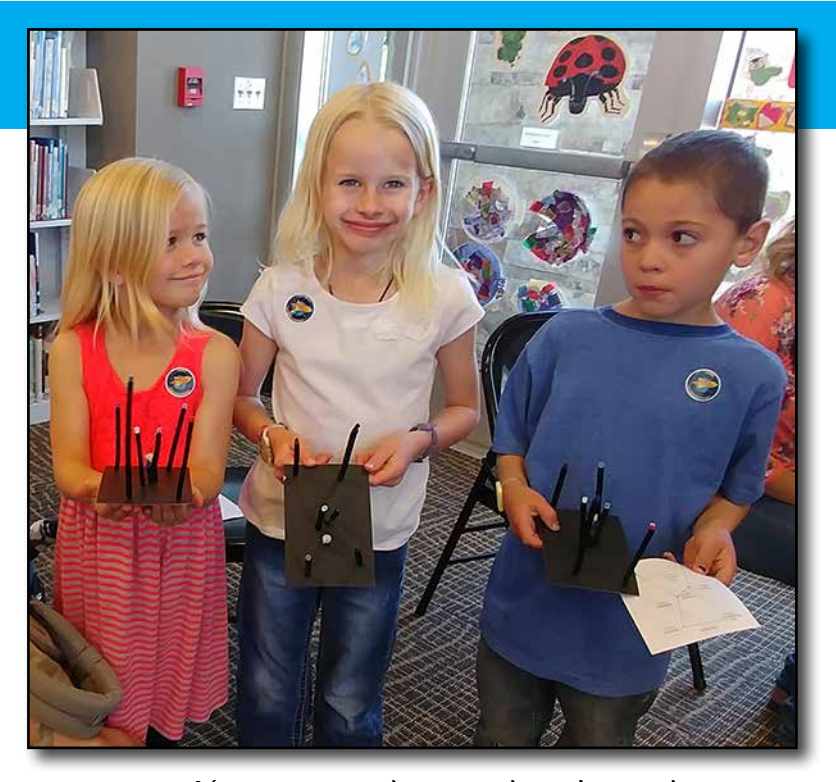
New activity showing the relative distance of the stars in the Orion constellation