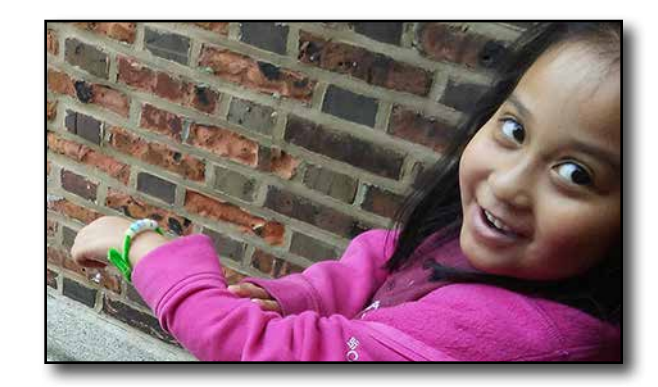
The "UV Light detectors" changed color showing that you can get a sun burn on a cloudy day.