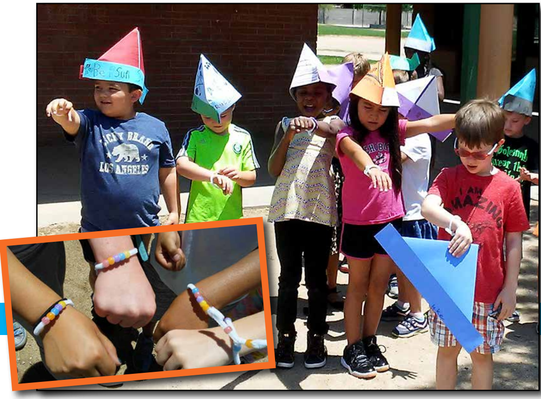
Several groups made their own Sun hats!