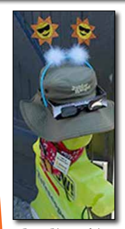
Timmy Telescope Solar Astronomy Outreach 2018

Thank you for educating us on the Sun and stars. Thank you for going out of your day to come out and show us the Sun from your amazing telescopes. Thank you for showing us the facts that we had never heard before. Thank you for making us feel like scientist studying the Sun. 11