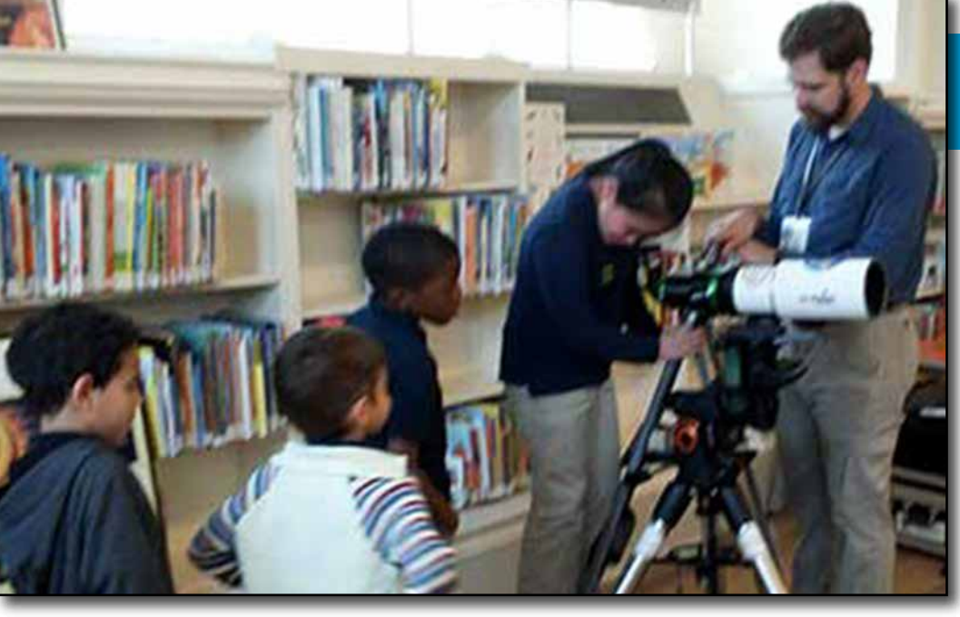
Inside "observing" with an image of the Sun across the room. For many, this was their first experience using a scope.