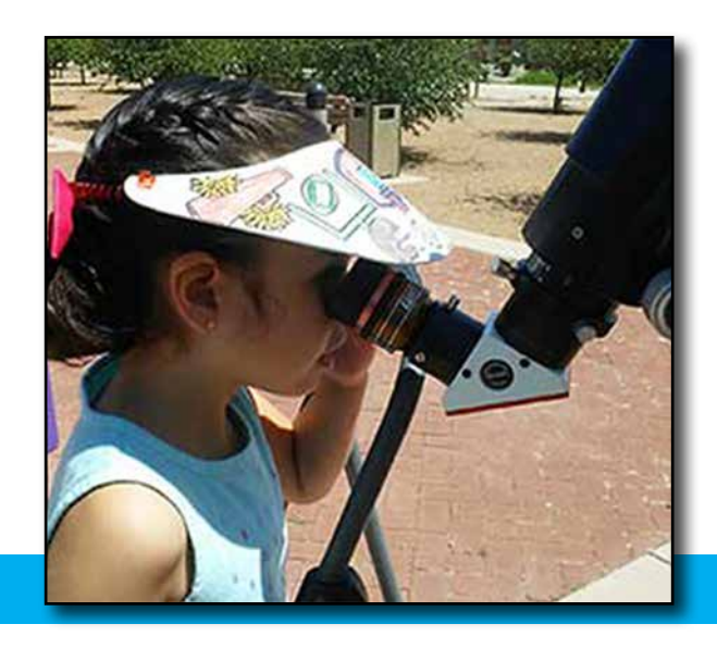
Timmy Telescope Solar Astronomy Outreach ~ 2018